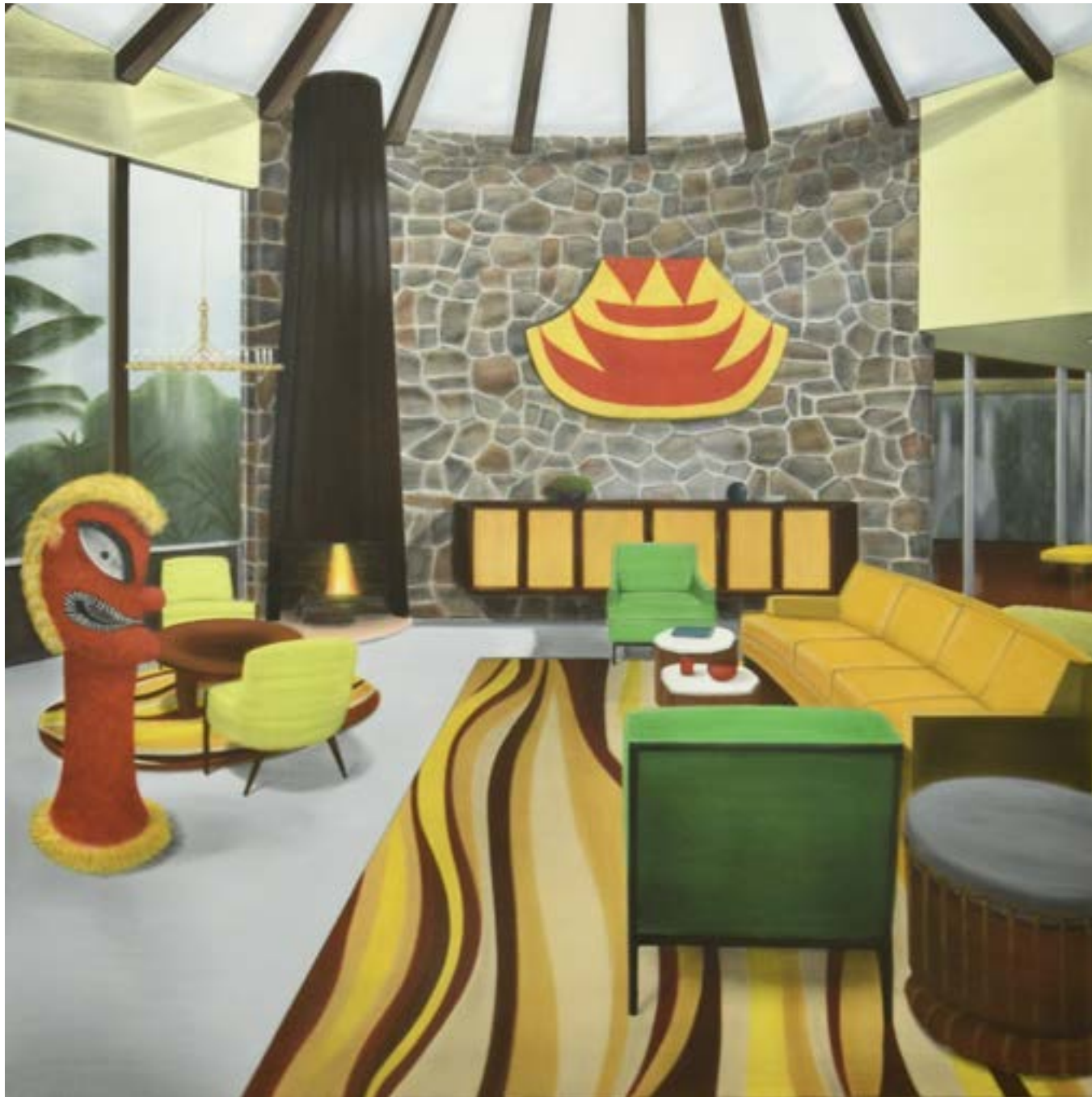
Untitled (Drum, Bowl, Feathered Head and Cloak) 2018