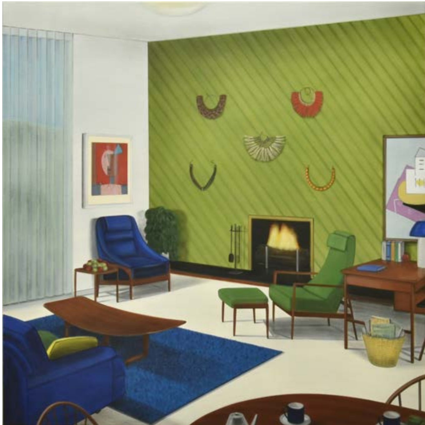
Untitled (Green Feature Wall) 2018