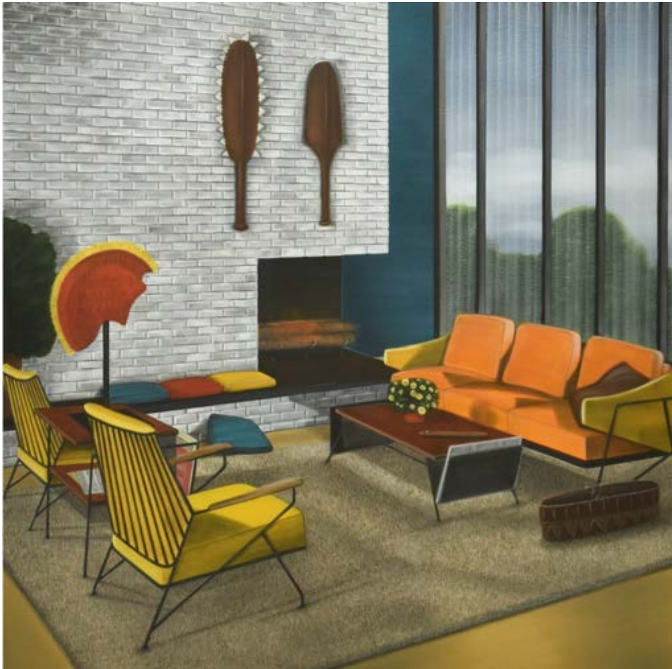
Untitled (Clubs, Basket, Beater and Feather Helmet) 2018