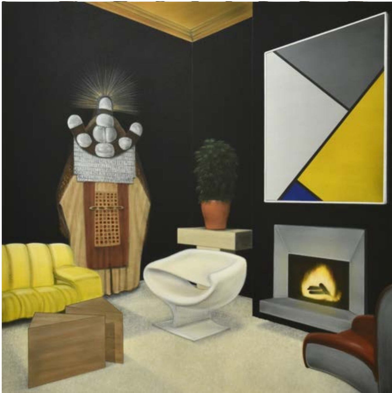
Untitled (Mourner's Dress and Neo-plastique composition) 2018