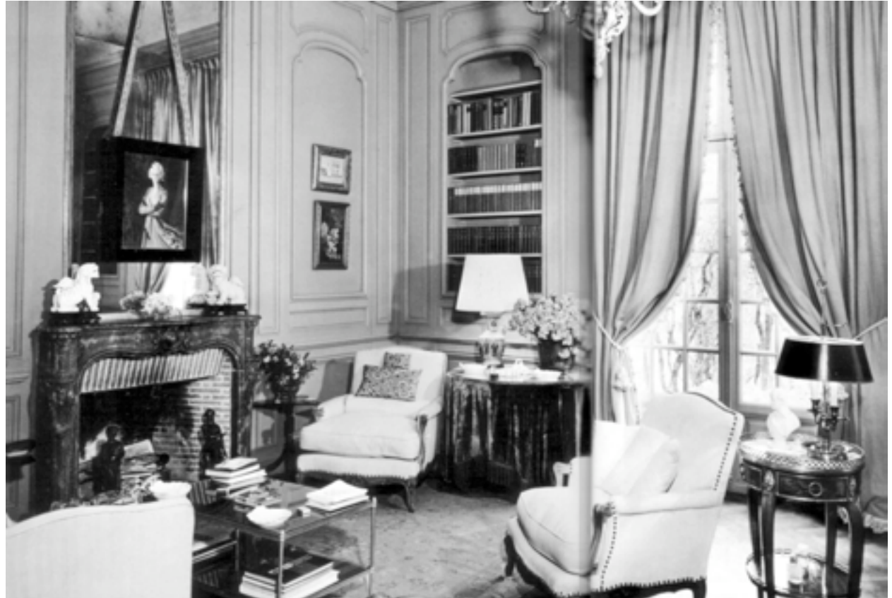
The Lounge Room, 'La Fiorentina' Saint Jean Cap Ferrat, Riviera, South of France.